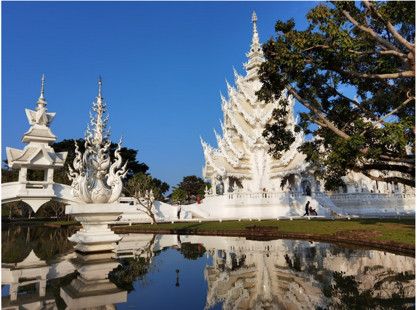
Figure 4: Wat Rong Khun - Chiang Rai

Be polite and show respect to all persons at all times. To all other sportsmen, visitors, workers, personnel of the facility and so on. You are an ambassador of your country, of SwissAAA and of dynamic sports shooting.