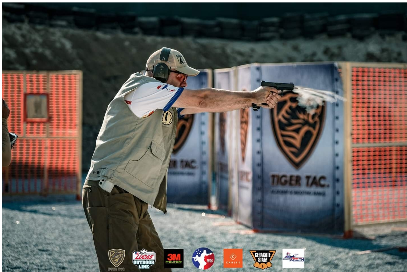
Figure 3: Shooting Action!

SwissAAA reserves the right to approve or disapprove participation without elaboration of reasons.