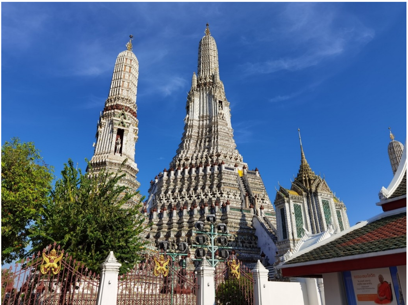
Figure 1: Wat Arun - Bangkok

All participants should arrange their travel such, that they arrive in Chiang Rai latest on Sunday, January 22 to participate in the team welcome dinner. We will fly back to Bangkok on Friday, January 27 in the late afternoon. The camp will end in the late evening of Sunday, January 29, after the competition party. Departure can be planned from Bangkok earliest on Monday, January 30.