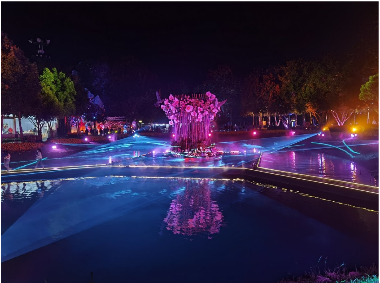
Figure 5: Flower Festival - Chiang Rai